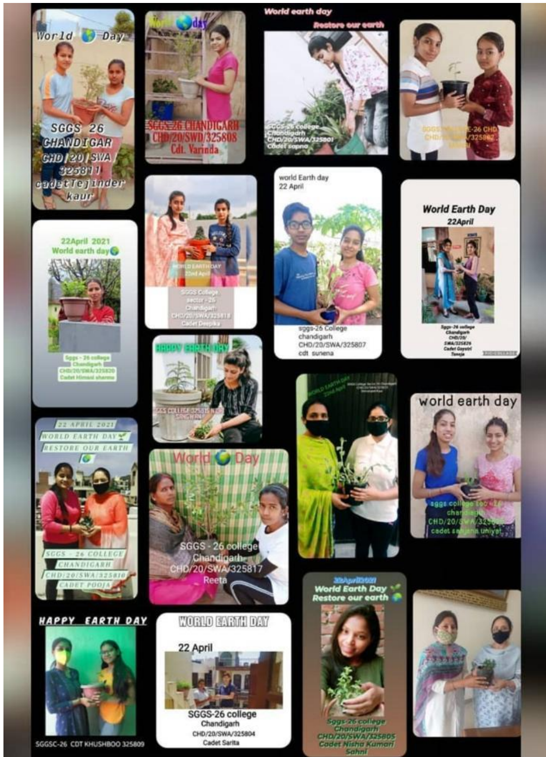
PIC : Cadets & CT donated plant saplings on EARTH DAY.