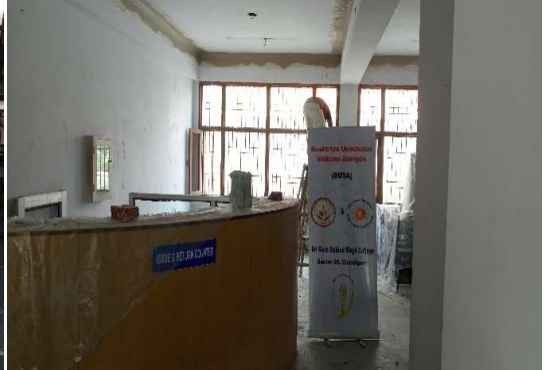
Polishing of Furniture and other Repairs