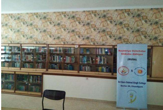
Installation of Blinds (Principal Office)/ Wallpaper In Library