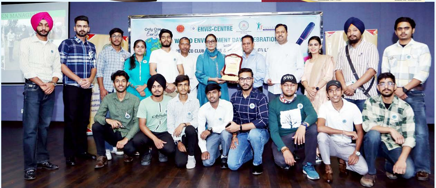
The National Green Corps Environment Society Award by Deptt of Environment, Chandigarh Administration