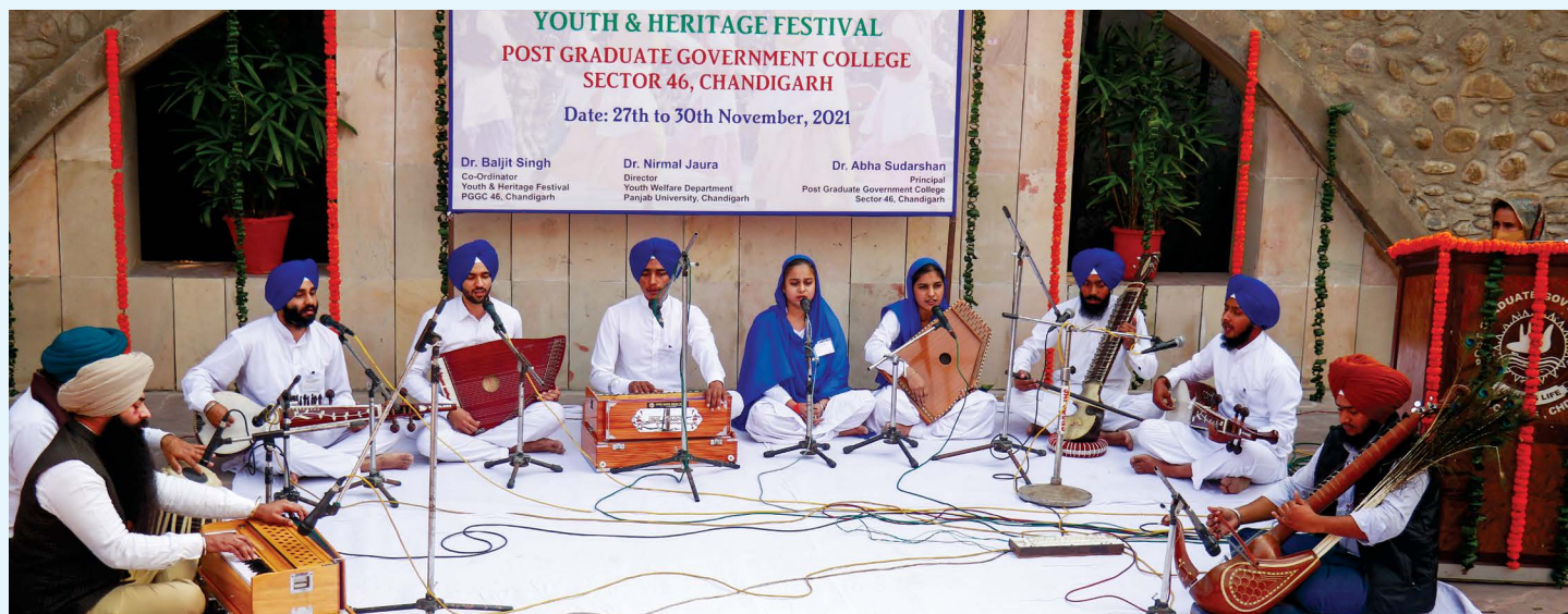
Group Shabad team 1 st in Zonal & 2 nd in Inter Zonal PU, Youth & Heritage Festival 2021-22