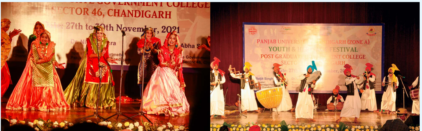
Giddha team 1 st in Zonal & 2 nd in Inter Zonal PU, Youth & Heritage Festival 2021-22 Folk Orchestra team 1 st in Zonal & 3 rd in Inter Zonal PU, Youth & Heritage Festival 2021-22