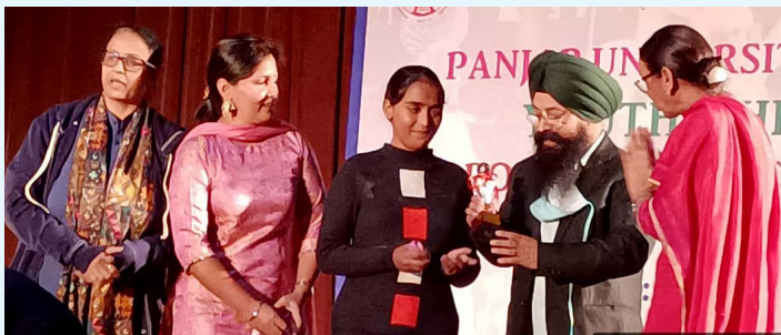
Special Honour for our talented Visually Impaired student for participation in PU Youth and Heritage Festival