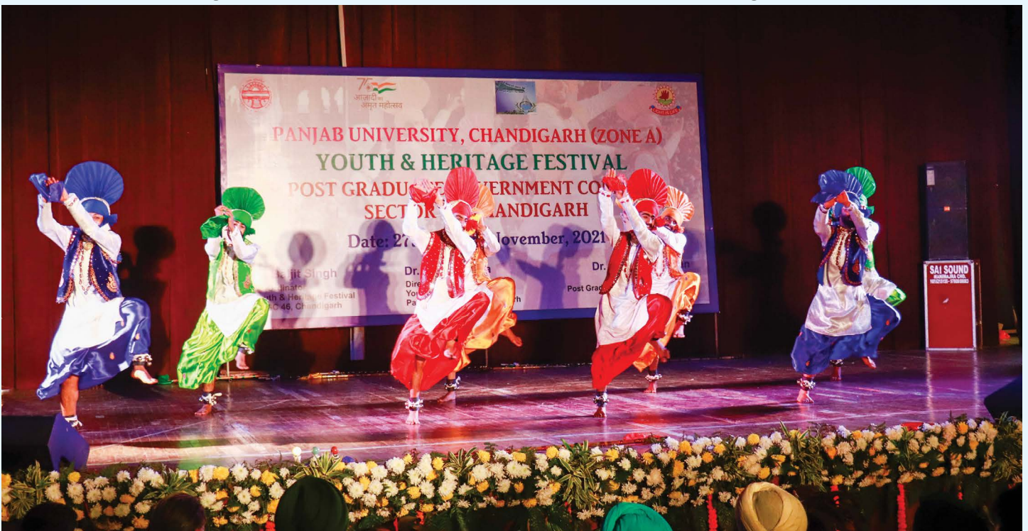
Bhangra team 1 st in Zonal & 3 rd in Inter Zonal PU, Youth & Heritage Festival 2021-22