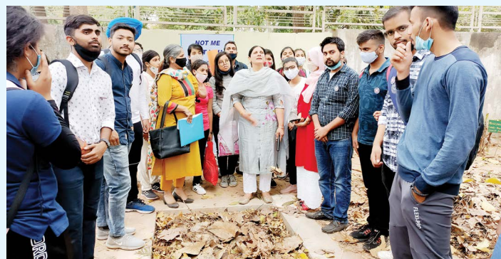
Bacterial Compost and Vermicompost from the Composting Unit are used as manure.

In consonance with the Eco-green Project Saugaat-Gift a Sapling Scheme, the College takes immense pride in felicitating the guests and dignitaries with Herbal/flowering plants grown in the College Gardens. Activities organised by the Campus Beautification Committee: