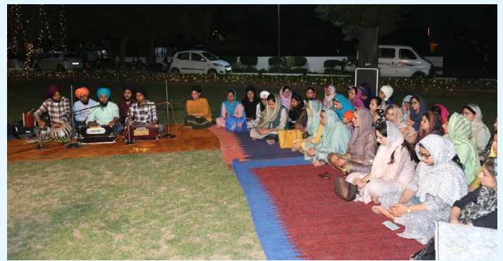
College students reciting a melodious chorus Aarti, composed by Sri Guru Nanak Dev ji in Barah Maha Garden of the College.

Various Inter-College Competitions, such as, Turban Tying for boys and Beautiful Dumala for girls, were held on Mar 14, 2022 to uphold the Best Practice of Heritage and Cultural Preservation of the College. The event witnessed participation by 30 students. A