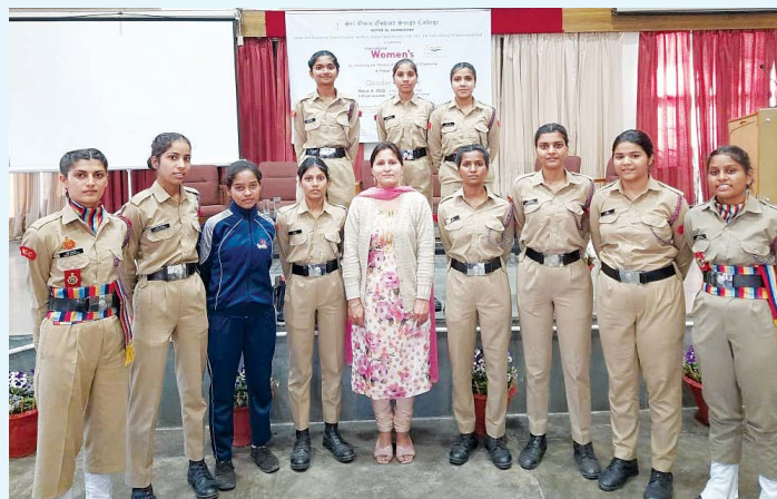
First-year cadets attending the Self-Defence Session organised to celebrate International Womens' Day on Mar 08, 2022.

village. The cadets also created a compost pit. The event concluded with Langar prepared by village people. A total of 30 cadets participated in the Camp.