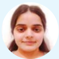
INDU (MSc Physics) GATE 2022