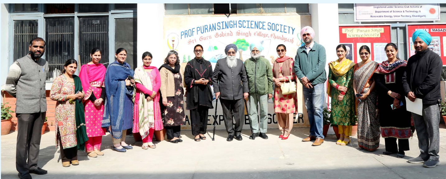
A Science Wall with Graffiti, a Wall Magazine and a Book Section dedicated to Prof Puran Singh's work, were inaugurated on Feb 15, 2022.