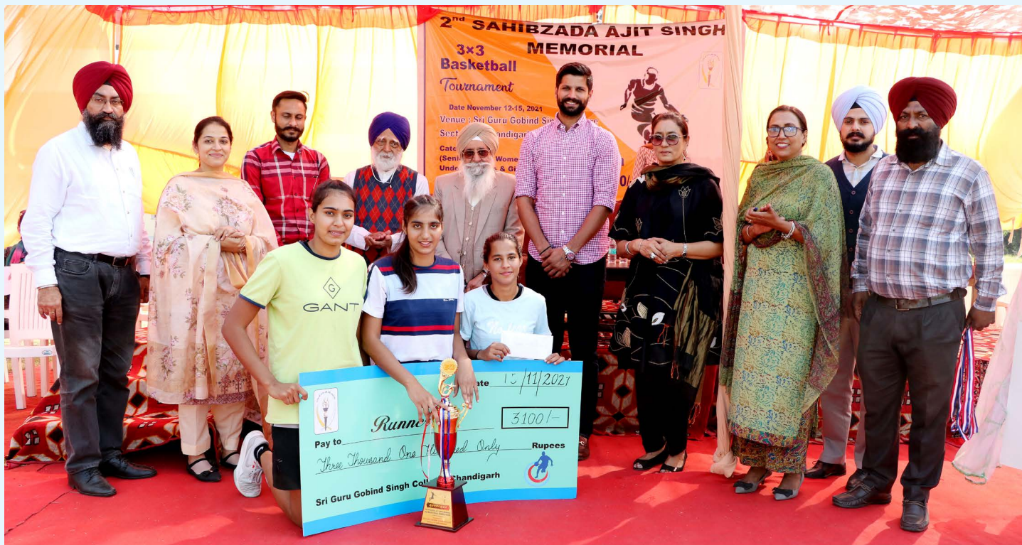
Rupinderpal Singh, Bronze Medalist, Tokyo 2020 Olympics and an Alumnus of the College, presided the Closing Ceremony of the Tournament.