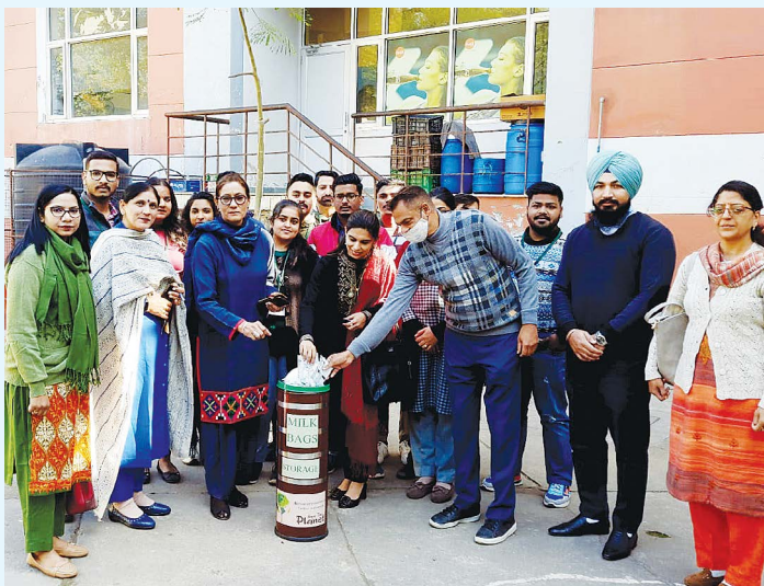
Launch of Milk Bag Recycling Project, an eco-friendly initiative of the College

The Society aims at working towards environmental conservation and creating environmental awareness. It is devoted to sensitizing the staff, students and community at large towards environmental issues, thus focusing on environmental sustainability. The society has been awarded the National Green Corps Best Environment Society Award by the Department of Environment, Chandigarh Administration for three consecutive years, 2018-19, 2019-20 and 2020-21 for its earnest efforts towards environmental consciousness. The society also won the Best Herbal Garden Award given under the aegis of the Department of Environment, Chandigarh Administration and Yuvsatta, NGO. The Eco Scouts, a student wing of Dharat Suhavi Environment Society, work towards sustainability and adopt eco-friendly practises. The Society organises Environment Awareness Drives, and Educational Trips for students.