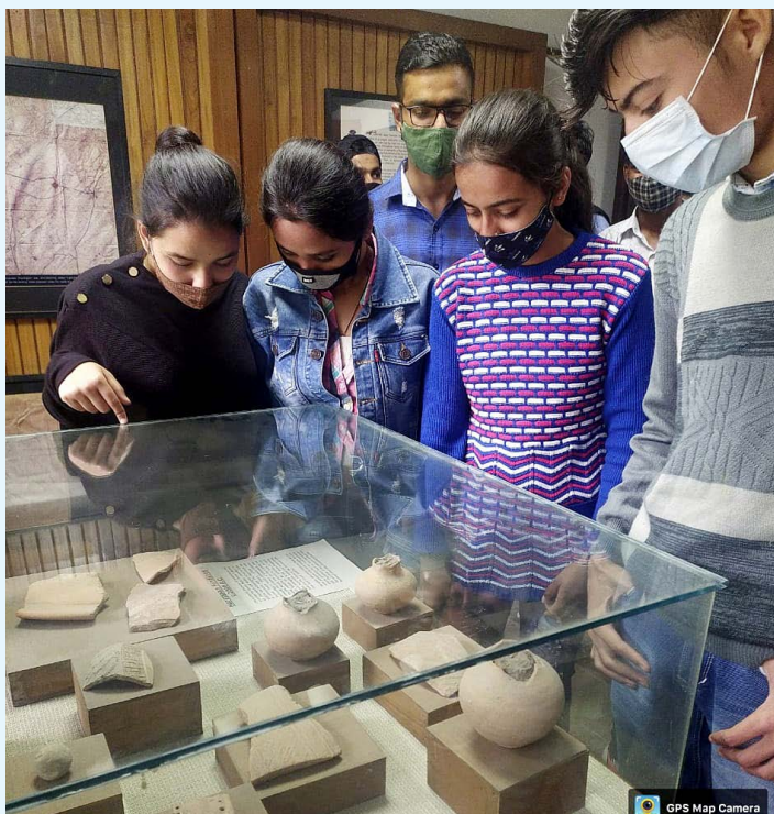
Visit to Le Corbusier Museum, Chandigarh