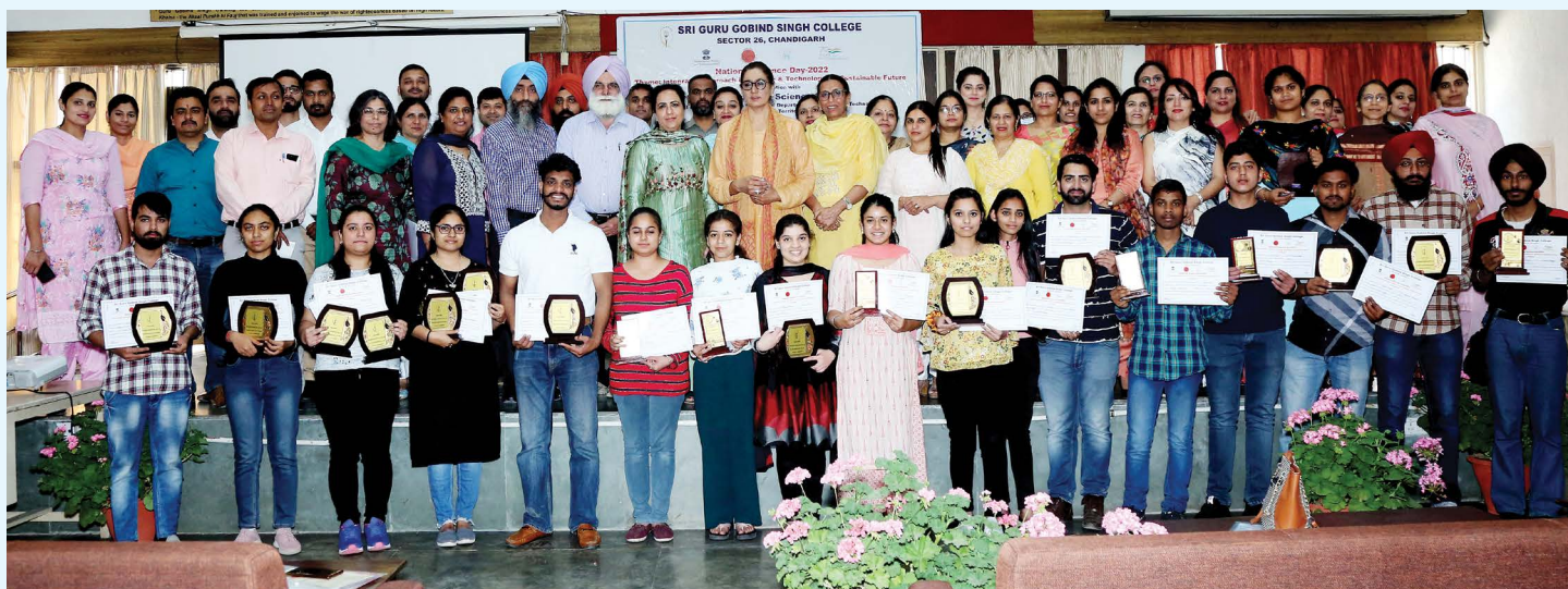
Winners of National Science Day Competitions - 2022