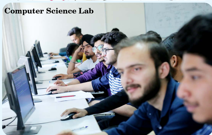
Computer Science Lab