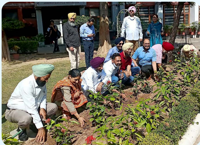
Alumni Members planting saplings in Barah Maha - Garden of Biodiversity

The College has a strong Alumni Association that connects and engages the alumni with their alma mater. The Alumni of the College serve the nation at various prestigious positions and are actively involved in the betterment of the College and students by providing financial and other support services. The office of the Dean Alumni Association ensures that the voices of all stakeholders -the faculty, the students and the alumni are incorporated into a holistic plan to support students’ development. An initiative of the Alumni Association, the Campus