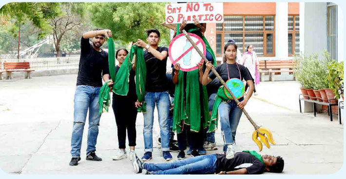
SGGSC theatre group Paigaam performing a Nukkad Natak 'One Earth, One Chance' to celebrate World Earth Day