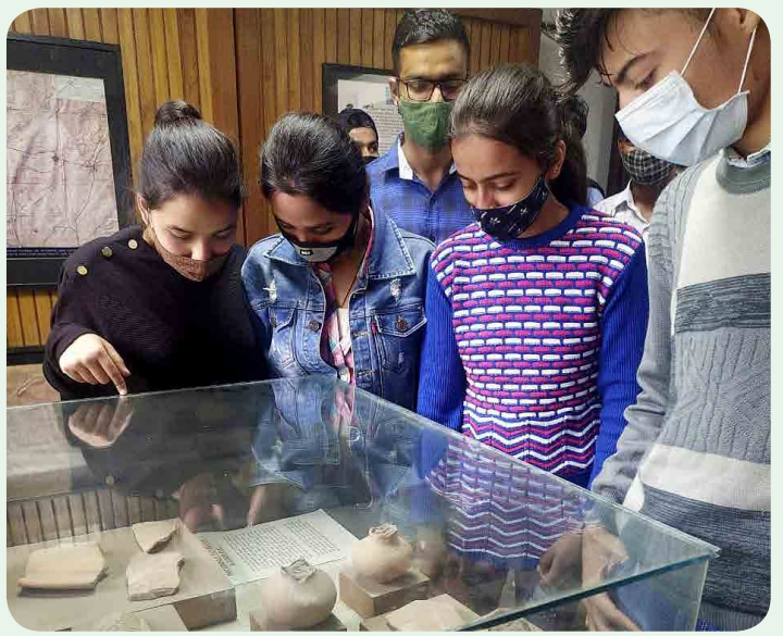
Visit to Le Corbusier Museum, Chandigarh