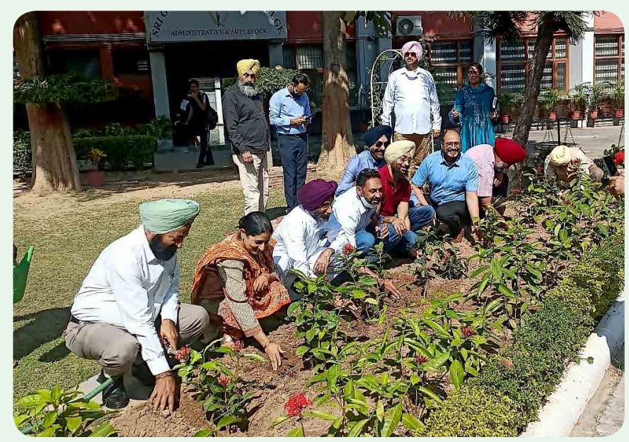
Alumni Members planting saplings in Barah Maha - Garden of Biodiversity