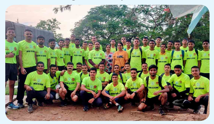
NEON RUN on Nashe Se Azadi organised by Narcotics Control Bureau, Ministry of Home Affairs, Govt of India in association with Chandigarh Police

Cyber Intern Program has been initiated and 80 students were registered as Cyber Interns.