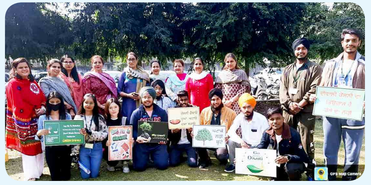
Green Diwali celebrated by students and Faculty to promote the Best Practice of Environmental Sustainibility