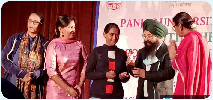
Special Honour for our talented Visually Impaired student for participation in PU Youth and Heritage Festival

The Cell promotes equality among all the students with an objective to bring about social inclusion and enhance diversity within the campus. The Cell along with PG Department of Sociology and the College Library has signed a MoU with the Institute of Blind, Sector 26, Chd to facilitate collaborative work for inclusion of the visually impaired students in the mainstream. The College has also collaborated