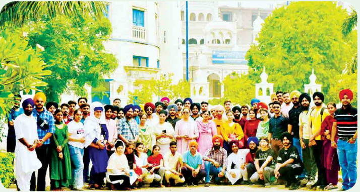
Religious Trip to Sri Harmandir Sahib, Amritsar