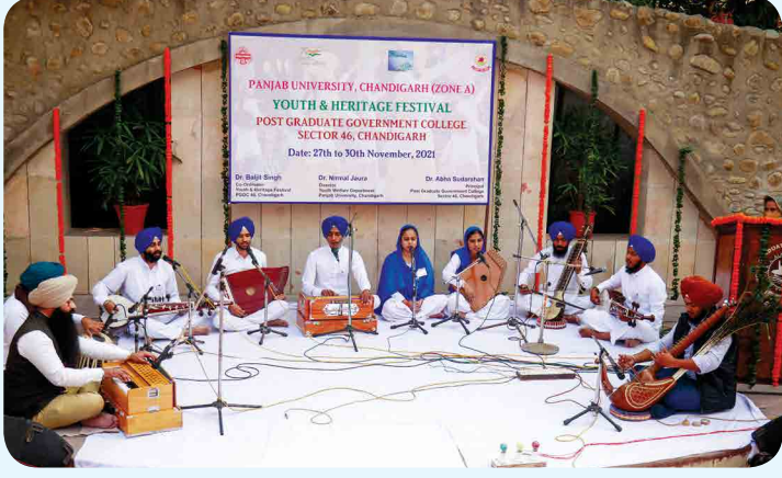
Group Shabad – 1st in Zonal, 2nd in Interzonal PU Youth and Heritage Festival