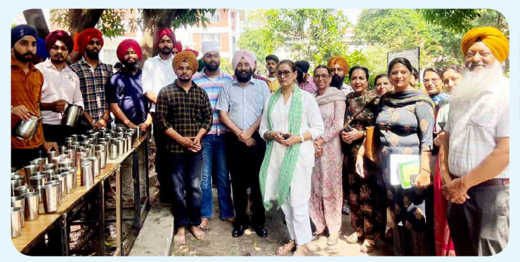
Institutional Distinctiveness of 'Seva' being upheld by the students who prepared Chhabeel Langar on the festival of Baisakhi