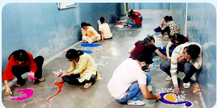
Students making animal themed Rangoli to celebrate World Wildlife Week