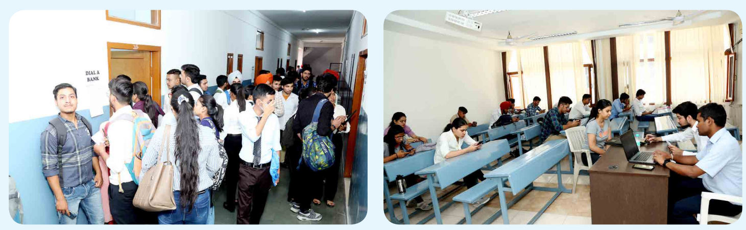
Campus Placement Drive 2022

Career Counselling through Awareness Programs regarding job prospects and recruitments is provided. The Cell also organises seminars, lectures, workshops, mock interviews and interactive sessions with experts for personality development and improving soft skills and leadership qualities.