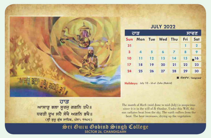
College Calendar 2022 was designed on the theme of Barah Maha Tukhari taken from Gurbaani artistically expressed through Paintings of an internationally acclaimed artist reiterating heritage and cultural preservation