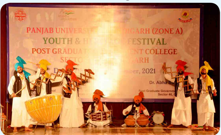
Folk Orchestra – 1st in Zonal, 3rd in Interzonal PU Youth and Heritage Festival