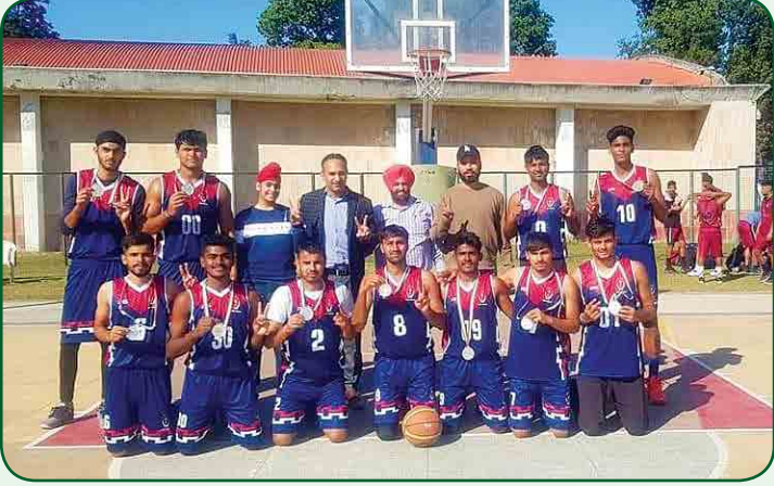
Runners Up of Basketball Panjab University Inter-College