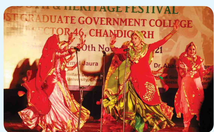
Giddha – 1st in Zonal, 2nd in Interzonal PU Youth and Heritage Festival