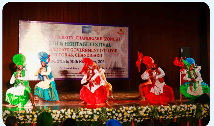
Bhangra – 1st in Zonal, 3rd in Interzonal PU Youth and Heritage Festival