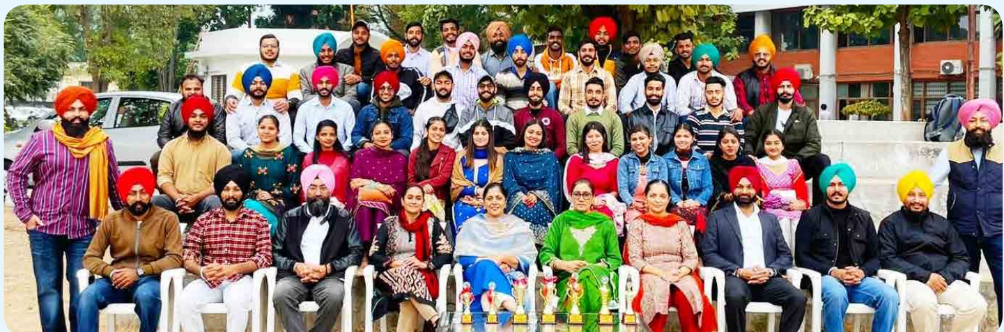
Prize winning teams at the PU Youth and Heritage Festival proudly displaying their trophies