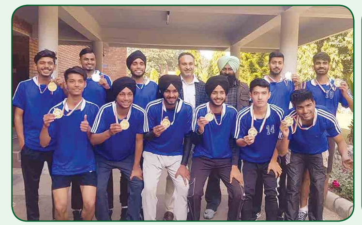
Winner of Sepaktakraw Panjab University Inter-College