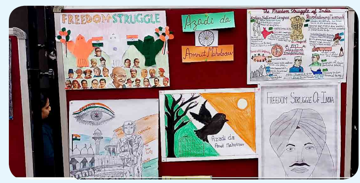
Prize winning posters on 'Freedom Struggle of India' to celebrate 'Azadi Ka Amrit Mahotsav'