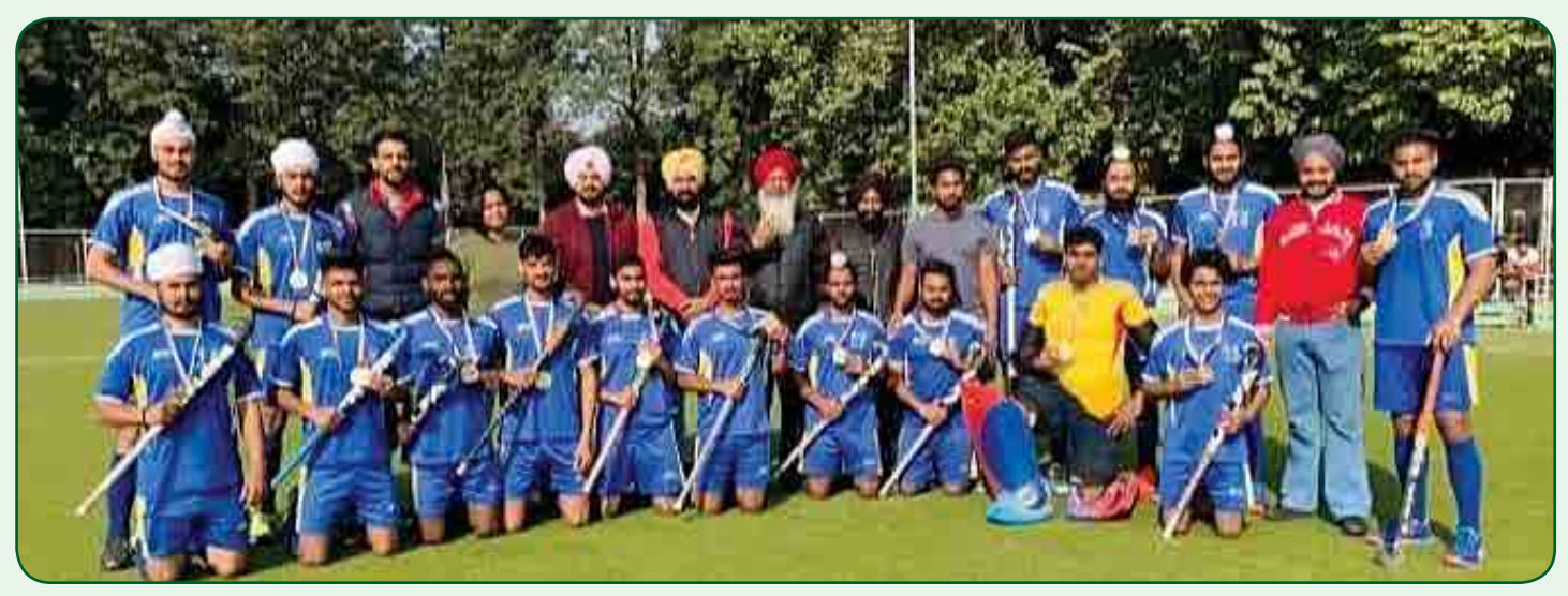
Winner of Hockey Panjab University Inter-College