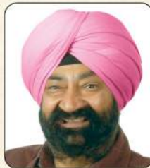
S. Jaspal Singh Bhatti Padam Bhushan (Posthumous) Actor, Director, Producer