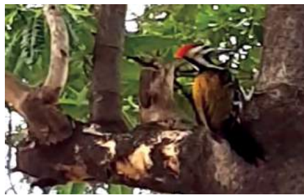
LESSER GOLDEN BACK Dinopium benghalense