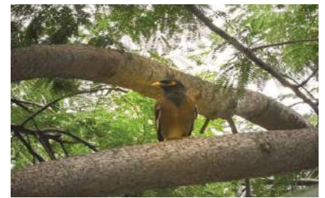
COMMON MYNA Acridotheres tristis