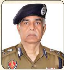
Sh. Suresh Arora, IPS Former, DGP, Punjab