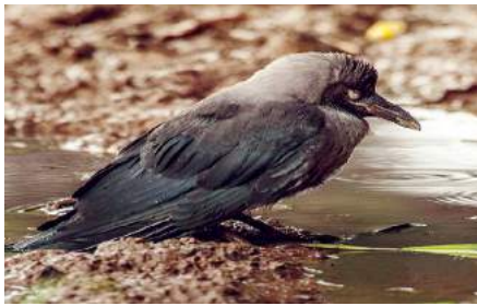
HOUSE CROW Corvus splendens