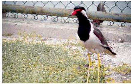
RED-WATTLED LAPWING Vanellus indicus