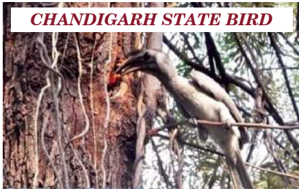
INDIAN GREY HORNBILL Ocyeros birostris