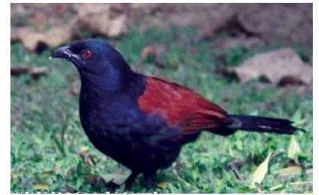
GREATER COUCAL Centropus sinensis