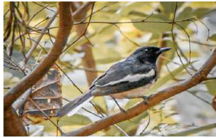
WHITE BROWED FANTAIL Rhipidura aureola