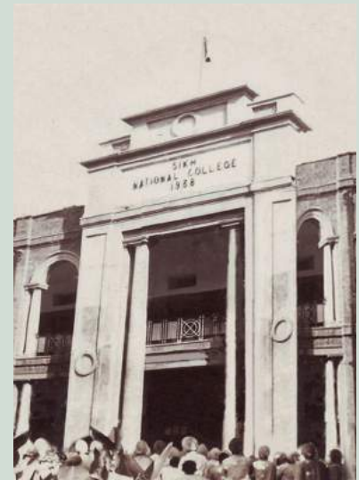
Iconic Sikh National College, Lahore, 1938