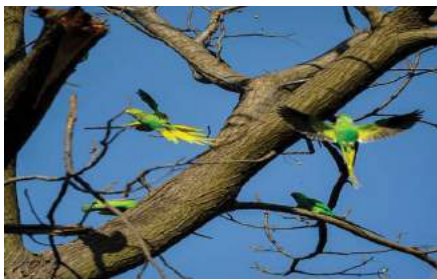
ROSE RINGED PARAKEET Psittacula krameri