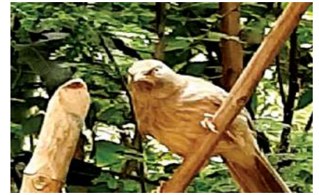
JUNGLE BABBLER Turdoides straita